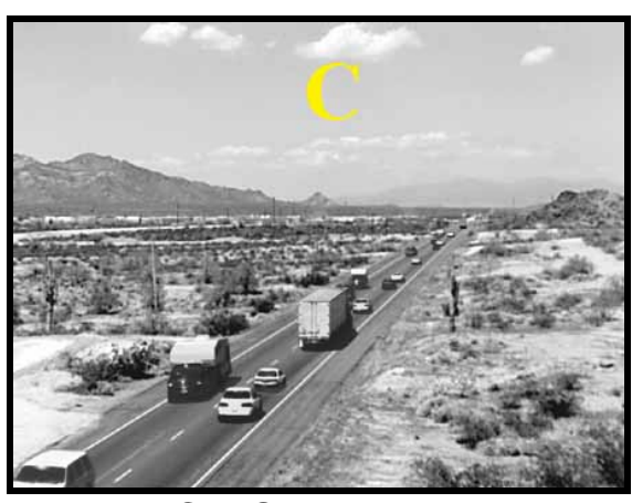
C = Stable Flow