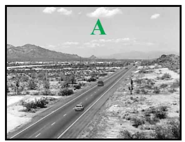
A = Free Flow