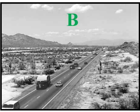
B = Reasonably Free Flow