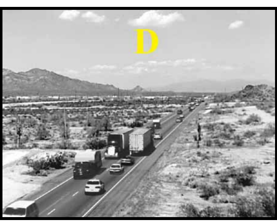
D = Approaching Unstable Flow